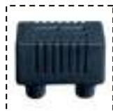
Capacitance Ext Module