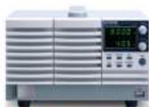
PSW 80-40.5 (0-80V, 0-40.5A, 1080W)