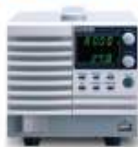
PSW 80-27 (0-80V, 0-27A, 720W)