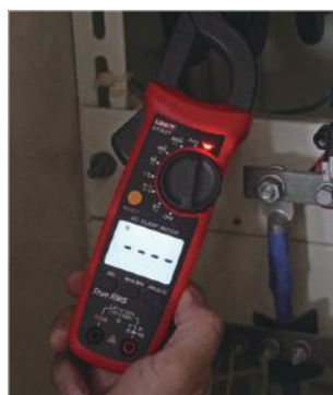
NCV multi-segment display and audio/visual alarm