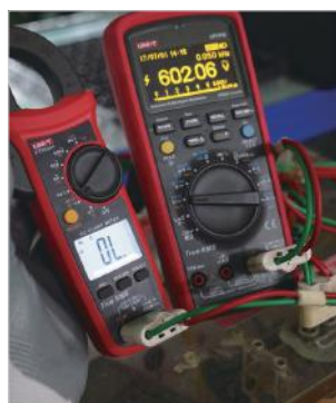
600V protection across all range