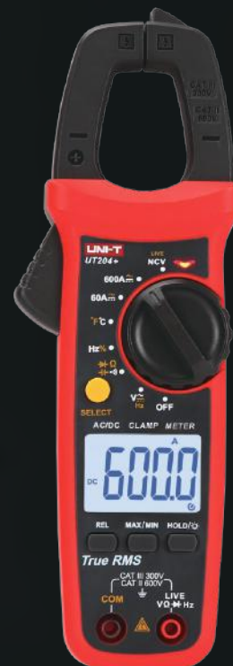
UT203+/204+ (AC/DC current)