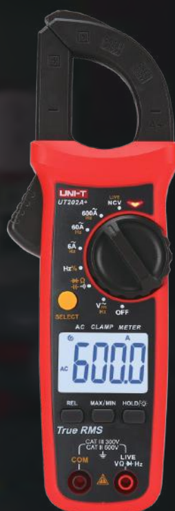
UT201+/202+/202A+ (AC current only)