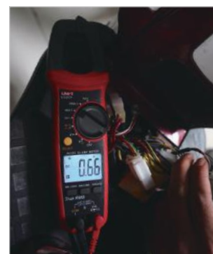
In current and voltage range measurement. Accuracy guarantee range 1%~100%