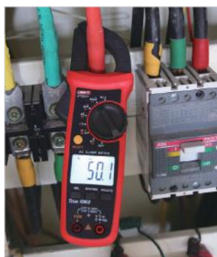
High voltage (600V) frequency measurement